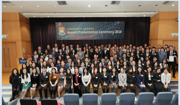
A group photo of the officiating guests and all award recipients

Let's take this opportunity to congratulate our awardees once again.