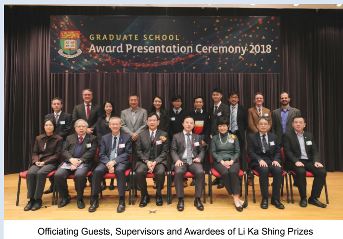
Officiating Guests, Supervisors and Awardees of Li Ka Shing Prizes

A total of 66 research postgraduate students of various disciplines received awards on December 12, 2018 (Wednesday) at the Award Presentation Ceremony organized by the Graduate School in Rayson Huang Theatre, HKU. The recipients were selected based on the quality of their thesis and academic performance.