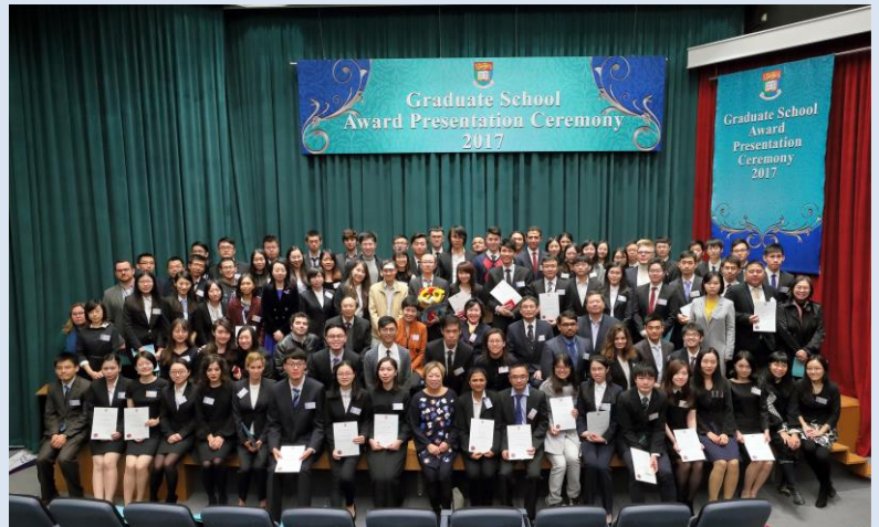
A group photo of the officiating guests and all award recipients

Let's take this opportunity to congratulate our awardees once again.