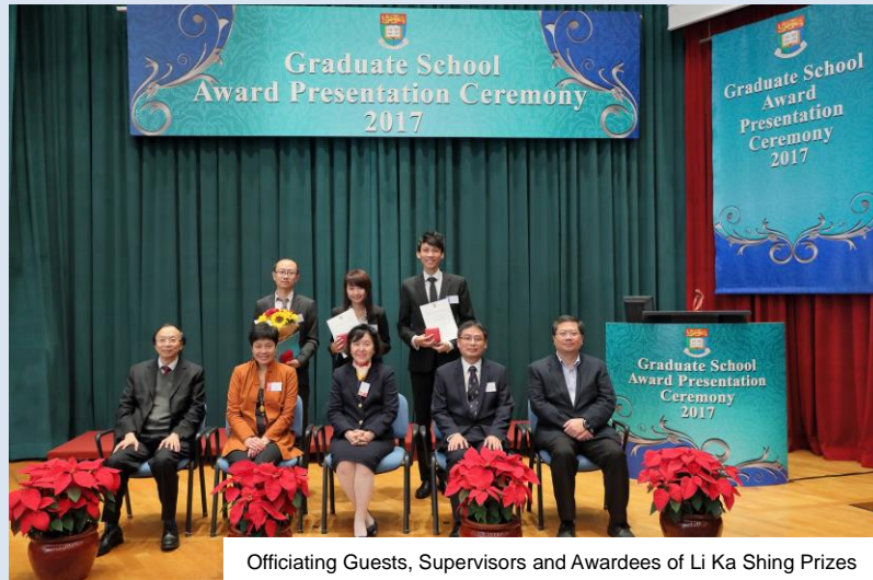
Officiating Guests, Supervisors and Awardees of Li Ka Shing Prizes

A total of 66 research postgraduate students of various disciplines received awards on December 13, 2017 (Wednesday) at the Award Presentation Ceremony organized by the Graduate School in Wang Gungwu Lecture Hall, Graduate House. The recipients were selected based on the quality of their thesis and academic performance.